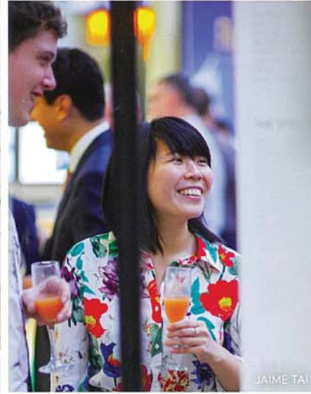
JAI ME TAI